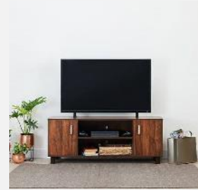
TV Unit & Coffee Tables