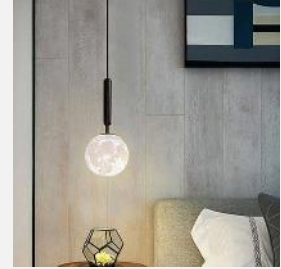
Home Decor & Lighting