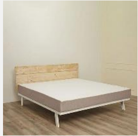
Mattress and Accessories

Wakefit is an Indian retailer of furniture with a presence both online and offline. They operate more than 15 stores across India. When shopping for furniture online, customers can explore their extensive range of living room furniture, which includes a selection of sturdy yet sleek sofa sets, TV units, coffee tables, and more. Additionally, Wakefit offers high-quality bedding products, wardrobes, home and garden items, and more to enhance your living spaces.