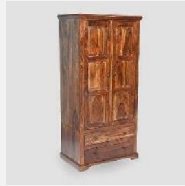
Wardrobe and Designer Table