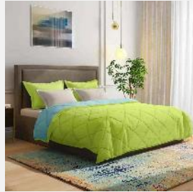
Blankets & Comforter