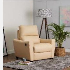
Sofa, Chair & Seating