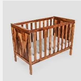
Kids Mattress & Cribs