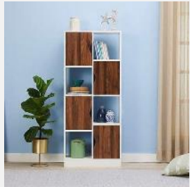
Tables & Shelf