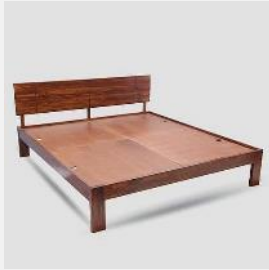
Beds and Pillow